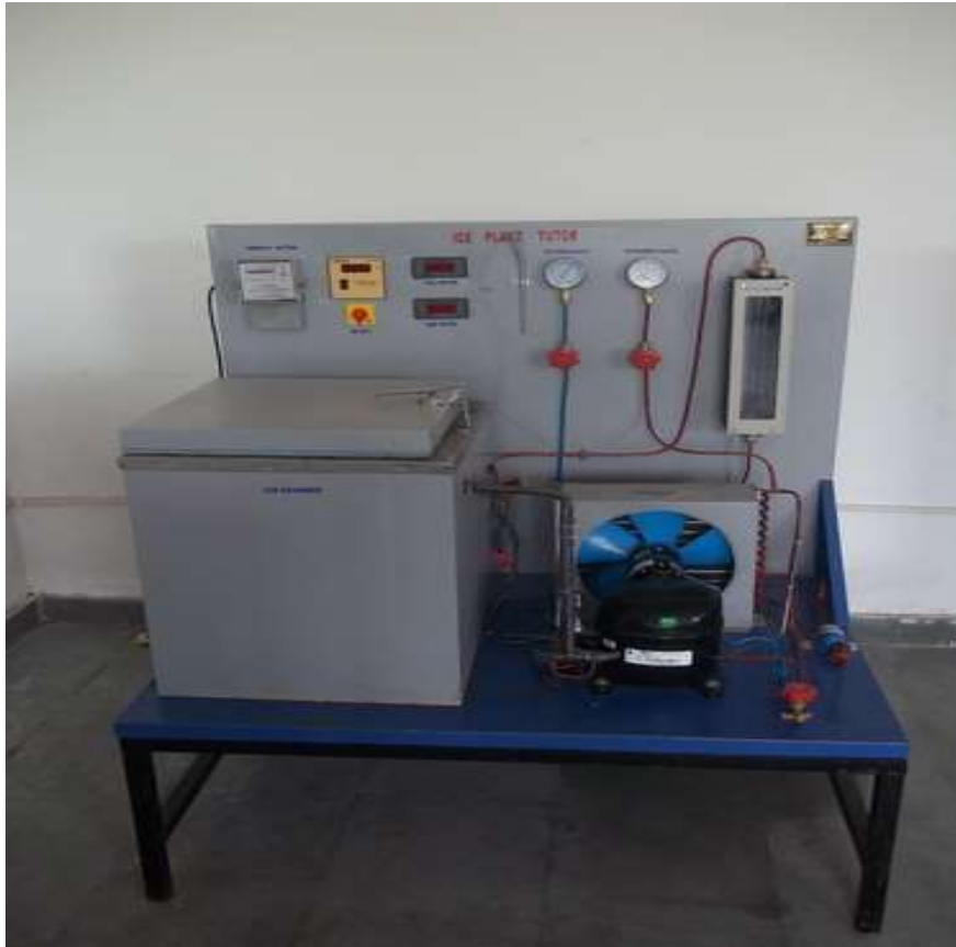
Fig.1. Refrigeration Test Rig